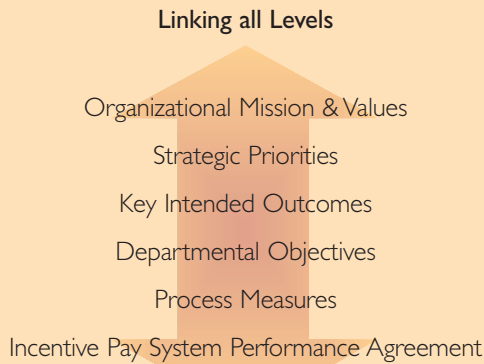
Exhibit 3: Incorporating Performance Agreements Throughout the Organization

neighborhood Slice of the Springs meetings, and relayed via the city magazine, CityTV, and the annual State of the City report.