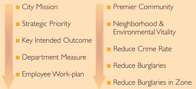
Exhibit 4: Aligning Employee Work Plans with Strategic Priorities

Exhibit 4 illustrates an example of aligning measures through the organization. The city’s mission is to be the nation’s premier community in which to live, work, and raise a family. One of the seven strategic priorities, which will help achieve this mission, is neighborhood and environmental vitality. One of the five key intended outcomes the City Commission has established to measure progress toward this priority is the city’s crime rate. Burglaries are a significant element in local crime, so the Coral Springs Police Department has implemented several initiatives in the business plan to reduce burglaries. The departmental measures of reduced burglaries will allow the police department to know if its efforts in reducing crime, and in achieving the strategic priority, have been successful. Likewise, individual officers are given the objective of implementing the anti-burglary initiatives on their beat. The burglary